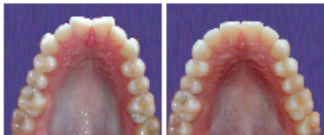
Rotated, crowded anterior teeth.

As time goes by, your teeth tend to shift, sometimes causing your front top and bottom teeth to become crooked. At first glance you may think you need braces, however with the patented Inman Aligner, your front teeth can be gently guided to an ideal position quickly and effectively, in a matter of weeks.